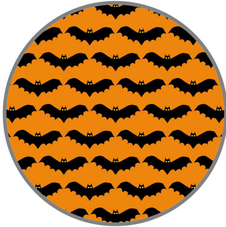
Halloween Gift Box Template - Page 1

Instructions: Print out this page. Cut out the circle along the gray line. This is the bottom of the box.